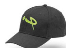
BLK / LIME