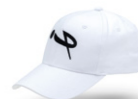
WHT / BLK