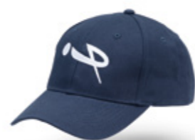
NAVY / WHT

UNISEX COTTON CAP, ADJUSTABLE VELCRO AND LOOP CLOSURE. EMBROIDERED LOGO AND EYELETS FOR AIR CIRCULATION. PRECURVED VISOR AND SWEATBAND. ONE SIZE / COMPOSITION 100% COTTON / FABRIC TWILL.