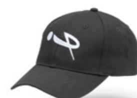
BLK / WHT