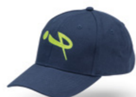
NAVY / LIME