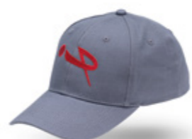
GRY / RED